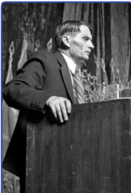
Figure 3. Trofim Lysenko speaking at the 1948 VASKhNIL conference.