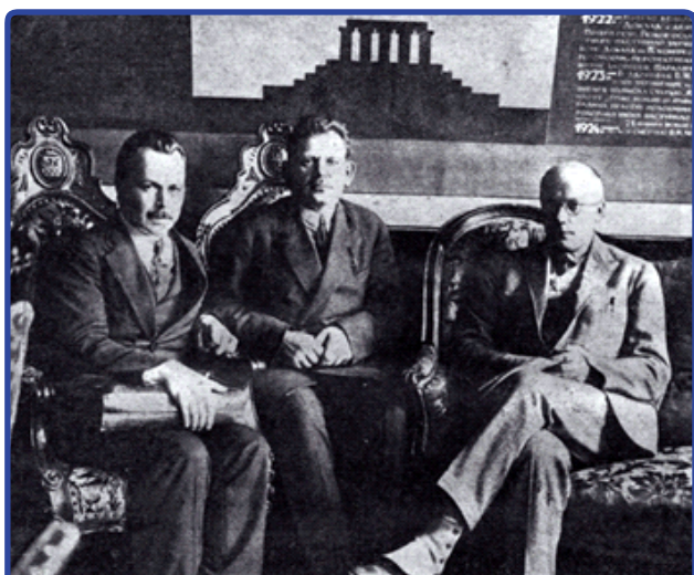
Figure 1. Nikolai Vavilov (left) with other members of the executive committee at the First All-Union Congress on Genetics and Plant and Animal Breeding held in 1929.*

In fall of 1929, Nikolai Vavilov organized the First All-Union Congress on Genetics and Plant and Animal Breeding (Figure 1.) (Kolchinsky, 2014). Lysenko