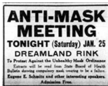
FIGURE 4 Flyer promoting the Anti-Mask League rally occurring on January 25, 1919.

https://static01.nytimes.com/images/2020/07/17/multimedia/00xp-virus-1918masks-anti/00xp-virus-1918masks-anti-jumbo.jpg