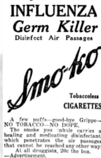
FIGURE 3 Example of pseudoscientific advertising used during the 1918 Flu Pandemic

https://digging-history.com/wp-content/uploads/2020/03/The_Brooklyn_Daily_Eagle_Thu_Nov_14_1918_p21-Smo-ko-tobaccoless-cigarettes.jpg