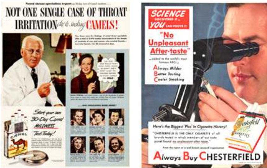
FIGURE 1 Cigarette advertisements appearing in 1947 and 1951

http://tobacco.stanford.edu/tobacco_web/images/tobacco_ads/pseudoscience/single_case/large/case_01.jpg http://tobacco.stanford.edu/tobacco_web/images/tobacco_ads/pseudoscience/pseudoscience/large/pseudo_01.jpg