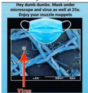
Meme retrieved from social media promoting pseudo-science about mask effectiveness. Note the meme wrongly indicates viral particles can be seen through a microscope at 25x magnification.

https://www.facebook.com/TheCaliforniaPatriot/photos/a.106970434001526/320261816005719/